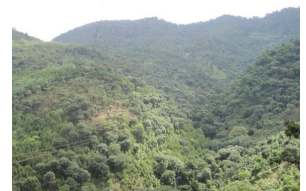
Don't see these in Florida