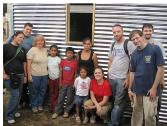
A home built, a family united

The month of August saw our mission team go off to Guatemala. Enjoy some of the pictures; read the "From the Pastor's Desk" article to learn more about what took place.